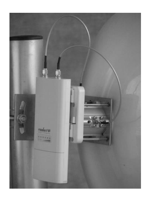
Fig. 2 Use of antenna with GentleBOX and GentleClip