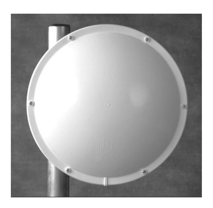
Fig. 1 Basic antenna design